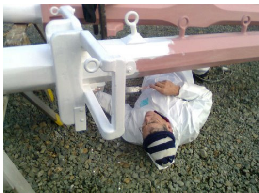
Finishing the work