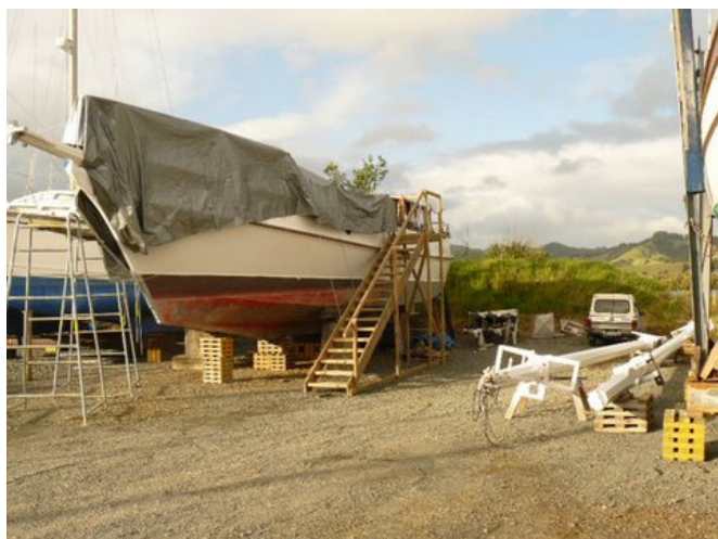
Out of the shed

In the last newsletter we explained we can use Maggie as a day boat with no more than 12 people below decks at one time. This put some solid limitations on how we could operate however it was manageable. In the past month we have found out that we can have up to 30 people below decks under the 40e ruling. This is great and makes Maggie a lot more workable with the current set up below decks. This means we can operate safely without some major deck modifications and without modifications below decks. These changes will come in time but that is another hurdle removed from our path.